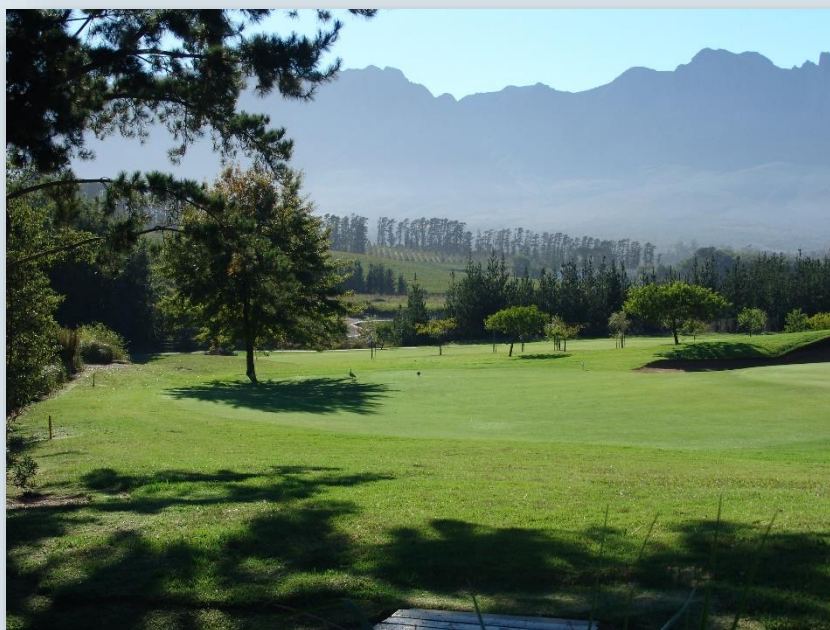
Golfclub Erinvale Somerset West South Africa Hole 14